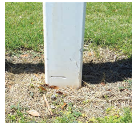
As these photos show, Fence Armor can hide existing damage to the base of a post as well as prevent further damage.

Fence Armor is constructed of durable, recyclable G90, 22-gauge galvanized steel and installs in under a minute. It is offered in a wide array of sizes, shapes and colors to provide full or half post protection and complie-